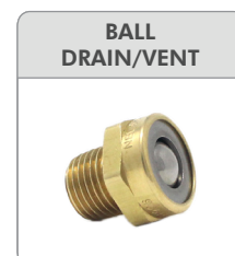
10752 Upstream - to release air.