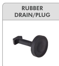
9800-100 Downstream - to drain gun.

The EGBP-Valve fits between the pump discharge flange and the stainless steel companion flange. The companion flanges are included with the HC-EGBP.